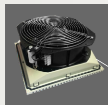
1 Black Shell